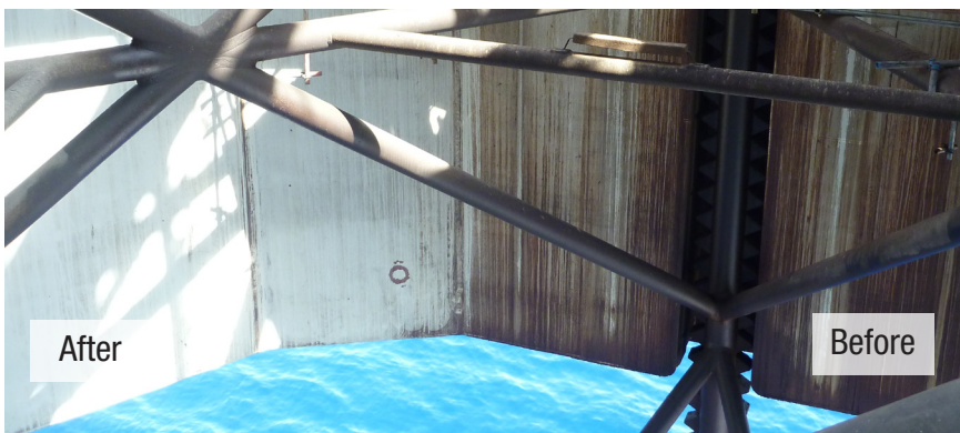
At extremes of needing to clean an offshore oil rig that has succumbed to fire damage, this photo illustrates the before and after benefits of using Cyndan's Biodegradable UBC formula.

Great for general building maintenance to degrease and clean masonry, metals, timber and most hard surfaces. Ideal for stripping away grey oxidised timber residue and sap.